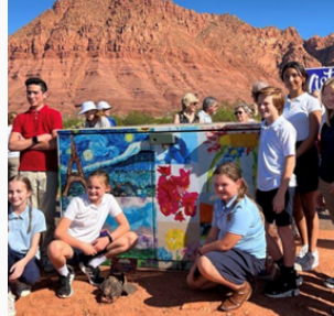
VISTA SCHOOL 2023