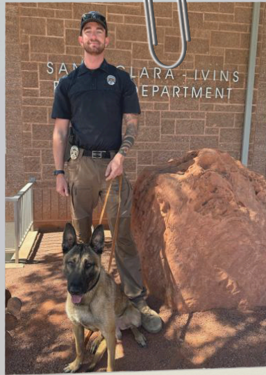
Meet K-9 Rosko