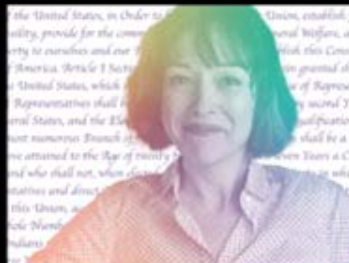
What the Constitution Means to Me